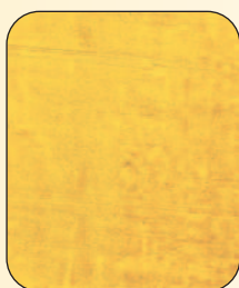
District 1 - At Large