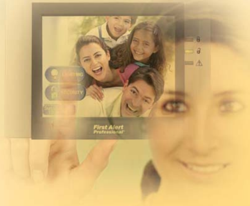
>> New TouchCenter keypads, allow a multitude of options in controlling your home and you can even customize them with a family photo.

Call People's Security to learn about your options at 828-4828 or 1-800-735-1440.