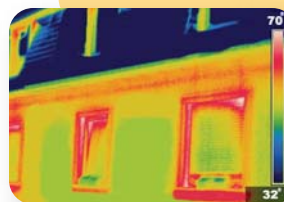
>> A thermal imaging camera can show areas where insulation or caulking is needed.

Tri-County Action Program, Crow Wing & Morrison County www.tricap.org > (888) 765-5597