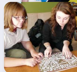
>> Local youth channeling adolescent energy into creative energy.